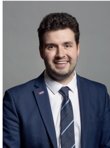
Elliot Colburn MP Chairman

As Chair of the APPG I welcome the report's findings and very much look forward to acting upon the recommendations. I will now work with the Vice-Chairs and all other Members of the APPG for Restorative Justice, as well as our Advisory Board to make a compelling case to the Government for reform in this sector.